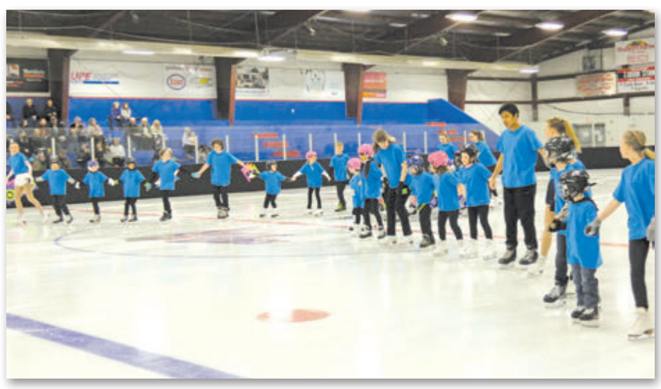
Spiritwood Skating Club members perform the ice show's opening number called "Jump".