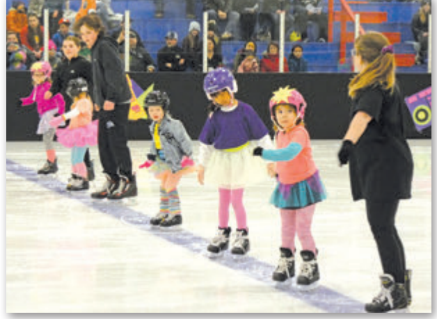
The CanSkate 1 kids perform Another One Bites the Dust.