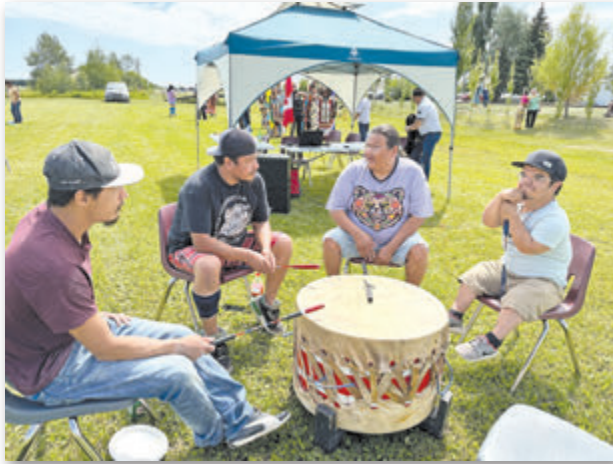
The Iron Nation drum group from Big River provided music for the traditional dances.