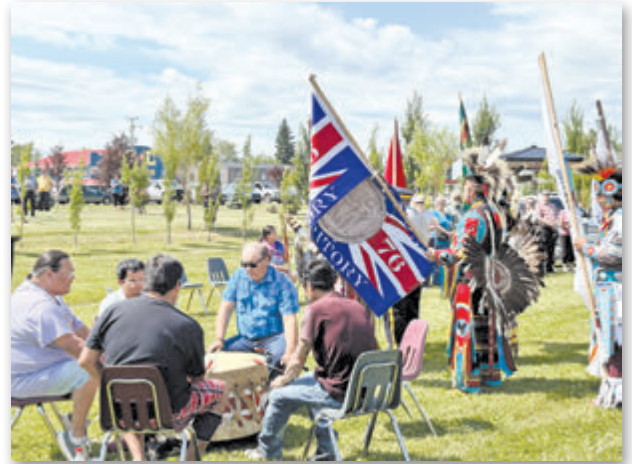
The day's program kicked off with grand entry of the flags and dignitaries.