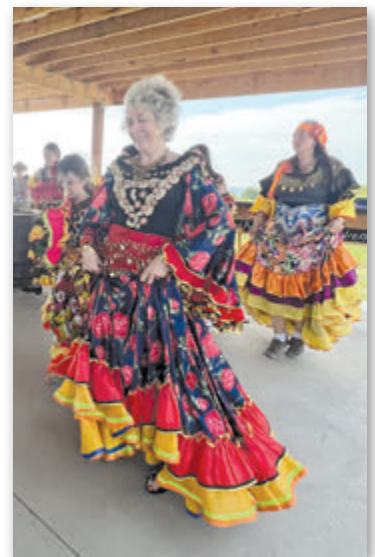
Dancers showcase the Russian Gypsy or European Roma dance.