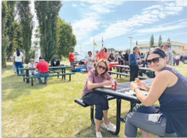
The large crowd enjoyed burgers throughout the day.