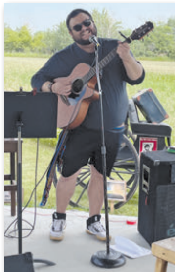
Guest performer Out of Frequency provided musical entertainment.