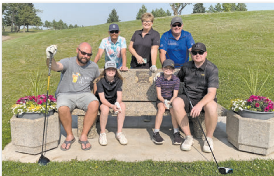
The first Lung Sask Benefit Tournament drew golfers of all ages to the Hidden Hills of Shellbrook.