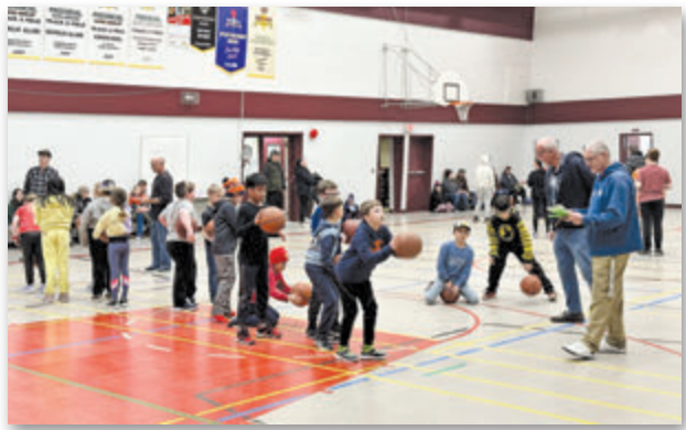
Volunteers and basketball throwers busy in competition.