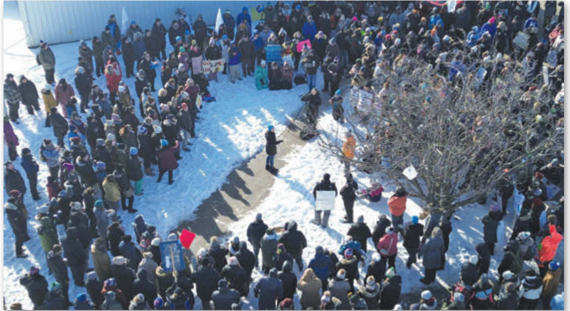
Educators gathered en masse in Shellbrook’s Veteran’s Memorial Park on Friday, Feb. 16, for their latest round of job actions.

“Teachers and students should be in the classroom, and the teachers’ union should be at the bargaining table.”