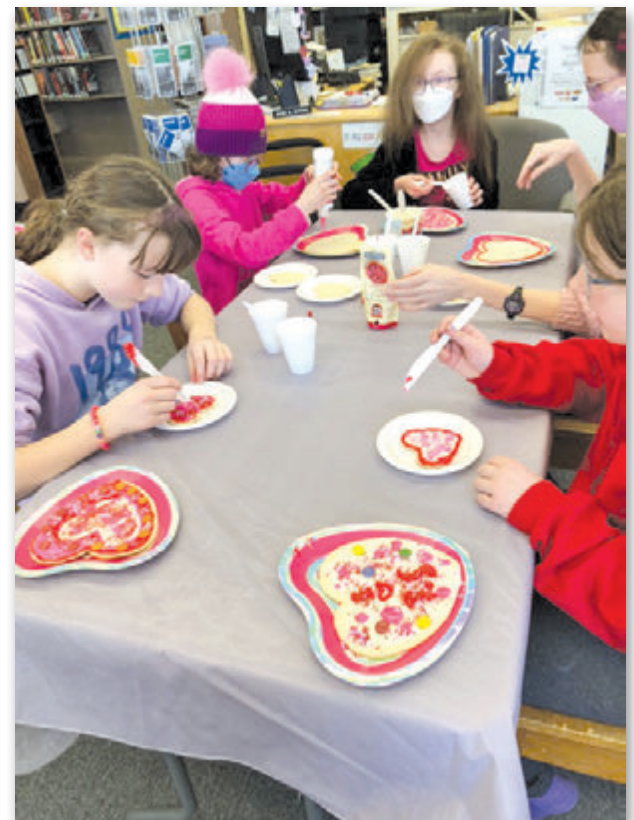
Kids got to decorate a large and a small sugar cookie (one to take home, and one to eat).