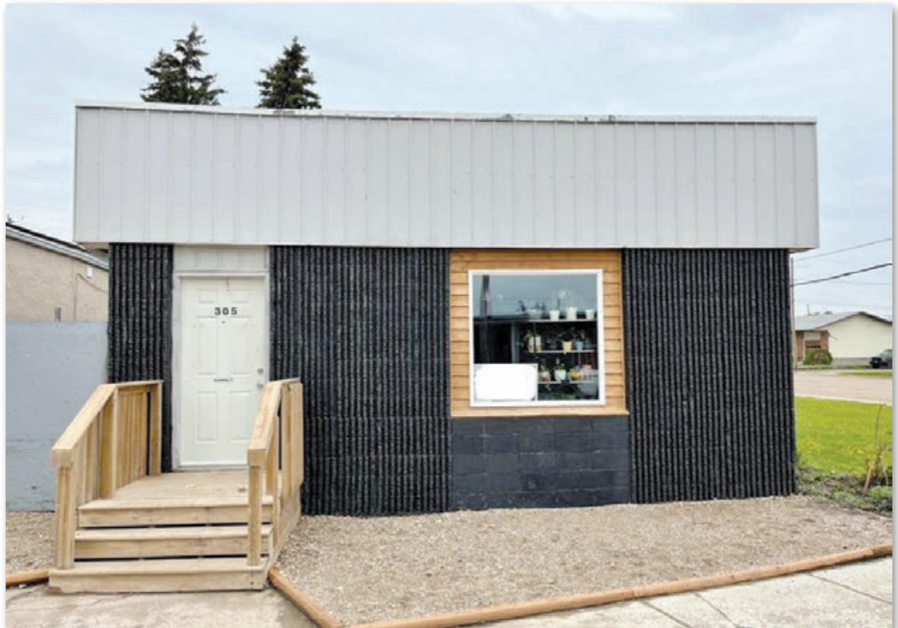
305 Main Street in Debden could be home to an Into the Weeds cannabis location, if council approves a request to have the property rezoned.

For many attendees with concerns about the negative effects cannabis can have on youth and fears that children could accidentally consume it, this was still too close for comfort.