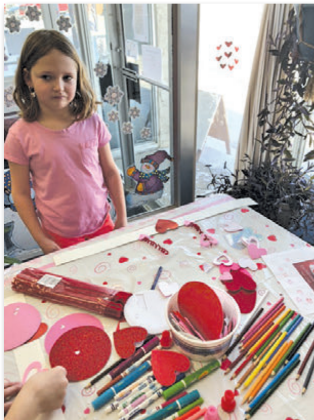
Valentine's Day headband crafts encouraged kids to be creative.

The craft was a headband with springy wiggly hearts. Also available were Valentine's Day themed colouring pages. Everyone enjoyed their afternoon.