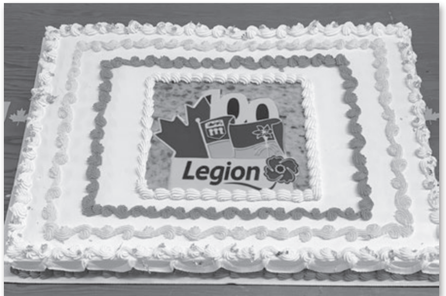
The Canwood Legion served a 100th anniversary cake at its Royal Canadian Legion centenary celebration on June 6.