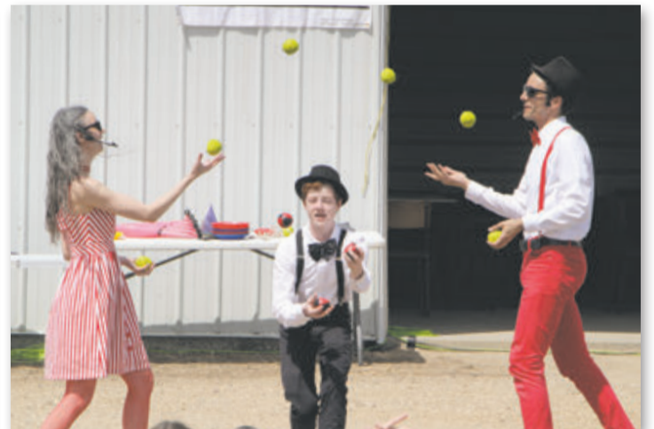
The Saskatoon Juggling Club put on two exciting shows in the afternoon.