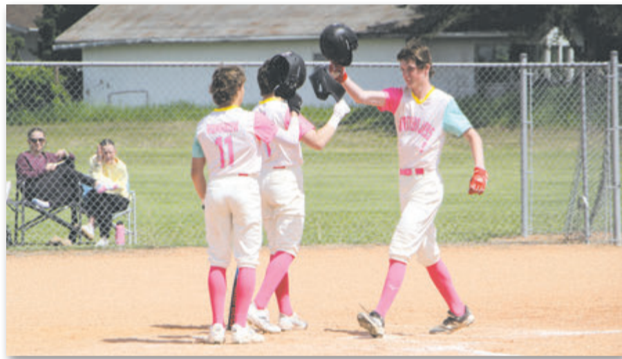
Northern Blue Jays players celebrate a big home run in U15AA baseball action.