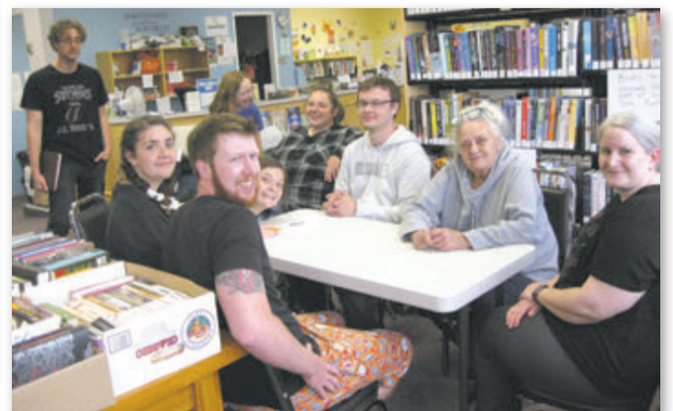
Participants take part in June's first trivia night.