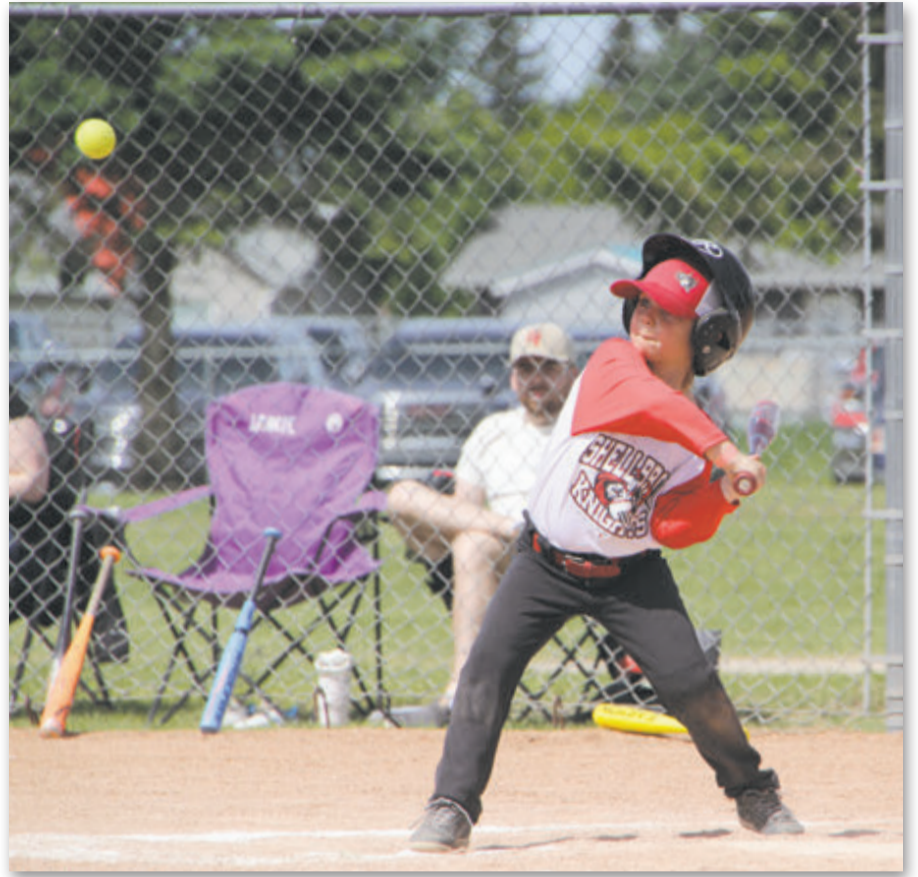
A U7 ball player eyes the ball for a big swing.