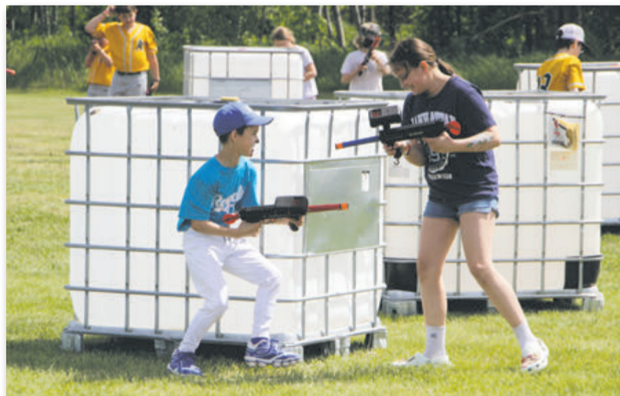
Kids take aim at each other in laser tag hosted by Paintball Paradise.