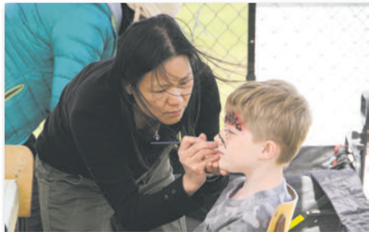
Face painters returned, giving kids colourful ways to express themselves.