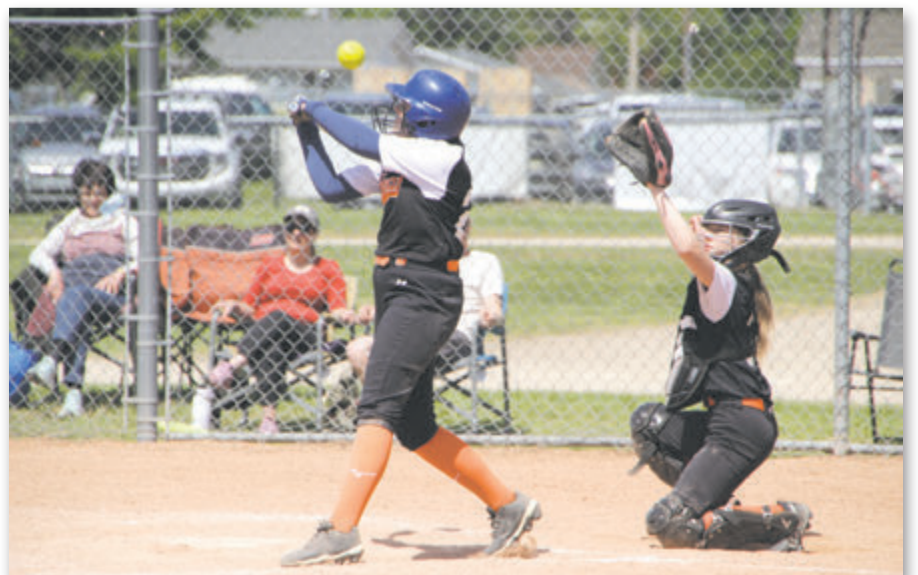
A Shellbrook Heat player swings high in U13 softball action.